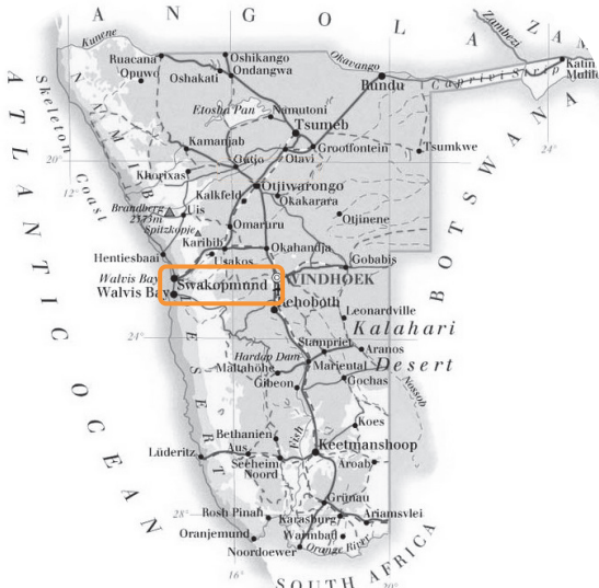
Illustration 1: Localisation of Swakopmund

Swakopmund (for mouth of the Swakop River) is a city on the coast of north western Namibia about 280 km west of Windhoek, Namibia's capital city. It is the seat of the Erongo Regional Council. The city has almost 60 000 residents and covers 193 km 2 . It is an example of German colonial architecture and a beach destination which attracts many tourists.