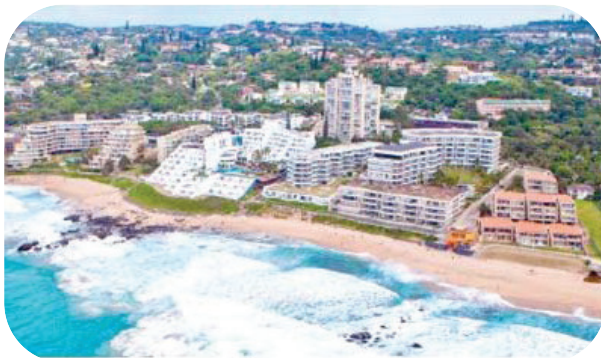
Illustration 2 : a municipality with almost 50km of coast

In terms of service delivery and social infrastructure the council has won several awards