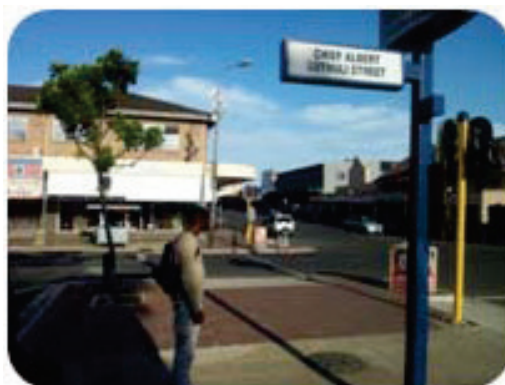
Illustration 9: City center of Kwadukuza