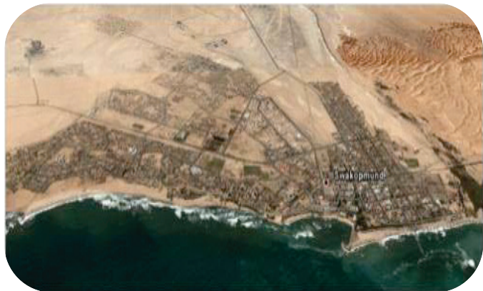
Illustration 2: Swakopmund a town in the desert

Due to increased urbanization, Swakopmund, like other bigger cities, is faced with challenges of making the city accessible and inclusive for new low income communities while, applying town planning, service delivery, budgeting and fiscal discipline principles. It has developed transferable learnings in the area of planning and service delivery as well as strategic planning budgeting and